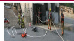
Fire Training Grounds Twining Road

We Hold drills each Monday Night at 7 PM