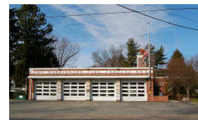
Station A 220 Summit Ave Fort Washington PA 19034

Fire safety is something that everyone needs to be aware of 24 hours a day, 7 days a week, 365 days a year. Do not wait until it is too late, practice fire safety every day! If you have any questions or comments about this article, or any other fire safety subject, please feel free to call the Fire Company at 215-646-2555 or stop into either fire station any Monday night. The Fire Prevention Committee is available to present programs upon request. Visit the Fort Washington Fire Company on the Internet at www.fortwashingtonfc.org .