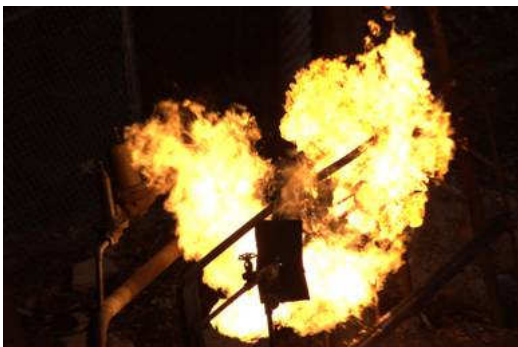
The ignition of the propane

On June 29th, FWFC members utilized the propane fire simulator at our training grounds. One of the many excellent training props built by members of the fire company, the propane simulator is designed to train fire fighters on using hose lines to displace the burning gas and allow access the shut off valves to stop the flow. A real-life scenario might involve a vehicle driving into piping on the outside of a building, which could cause a gas leak and fire. When dealing with fires involving an active gas leak, it is always preferred to shut off the supply of gas, rather than extinguish the fire, the exception being an immediate life hazard. Why, you might ask? When the fire is allowed to burn, it certainly looks impressive, but all operating personnel are aware of the source of the problem and can isolate the area. If the fire were to be extinguished without stopping the flow of gas, the gas could then travel into low lying or remote areas and ignite unexpectedly.