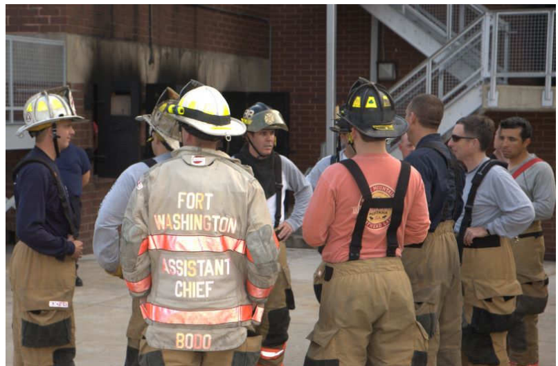
FWFC members gather to discuss the tactics they will use to attack the fire and search for victims.

Fort Washington members have been kept very busy with training. On June 8th, members traveled to the Montgomery County Fire Academy to conclude our high rise fire fighting class. Members were divided into groups and assigned the task of search & rescue or fire suppression in the high rise section of the county burn building. Our members now have more of an appreciation for the challenged faced in fighting fires in high rise or mid rise buildings. Thanks to FWFC member and Montgom-