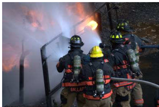
Firefighters shutting valves