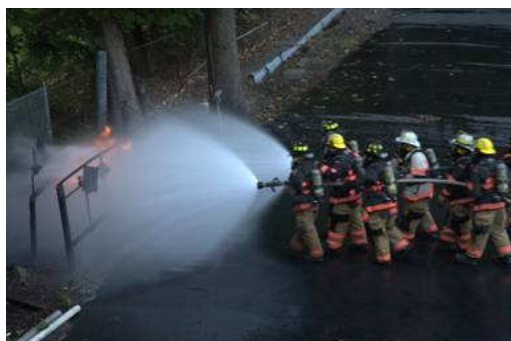
Members using two 1.75" hose lines to move in on the fire and allow access to shut off