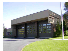
Station B Susquehanna and Twining Roads Dresher PA 19025